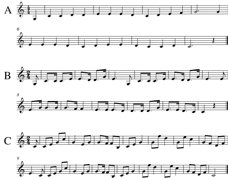
Figure 1. Three melodic extracts from the Essen collection to demonstrate expectancy-violation principles (A: erk0470, B: italia05, and C: Oestr022).

The differences between the principles can be illustrated with three examples taken from the Essen collection, all of which also belong to the D6 dataset. The notation and identities of these extracts are shown in Figure 1 and the extracted principles in Table 2. Melody A consists almost entirely of quarter notes: the tonal structure has low ambiguity, and successive pitches are mainly scale steps. The rhythmic structure of melody B is more complicated than that in melody A , but it has an otherwise similar melodic range and tonal structure. Melody C spans a large range, and therefore also contains large melodic skips and is varied in terms of note durations. Even though the differences in the apparent complexity of these examples is not immense, together they are able to show how the principles index subtle differences between the melodies. In terms of pitch skips, melody A sports the smallest (1.44 semitones on average), and melody C the highest (3.52).